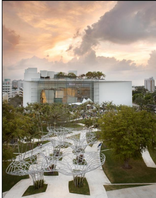
NEW WORLD SYMPHONY CENTER MIAMI BEACH, FL

Hines, The New World Symphony and architect Frank Gehry collaborated to design a unique facility that serves as a premier educational laboratory for innovations in the teaching and experience of classical music. The campus, located in the heart of Miami Beach, was designed to explore new performance formats, including large in-theater video displays and a projection wall and audio system for outdoor presentations. In addition to engaging existing local audiences, the campus has attracted new audiences for classical music nationally and internationally. The project was completed in 2011.