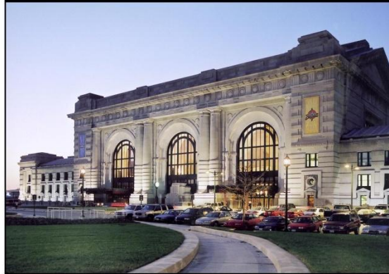
SCIENCE CITY @ UNION STATION KANSAS CITY, MO

Science City at Union Station is a $263 million adaptive reuse of Kansas City, Missouri's Union Station. Completed in 1914 and listed on the National Register of Historic Places, Union Station is now the second largest train station in North America (behind Grand Central Station in Manhattan). The project had two major goals: the creation of Science City, an interactive science museum, and the restoration of Union Station, Kansas City's greatest landmark. The project also included construction of an intermodal transportation center. Approximately 80,000 square feet of restaurants, shops and office space occupy renovated portions of Union Station which, in concert with Science City's 280,000-square-foot presence, establishes the site as a major attraction and destination for Kansas City and the central Midwest area. Financing for the project consisted of approximately $36 million in federal funds, over $100 million in private donations and $118 million provided through a bi-state sales tax initiative. Science City at Union Station was completed in 1999.