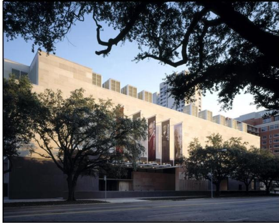
MUSEUM OF FINE ARTS HOUSTON HOUSTON, TX

The Museum of Fine Arts Audrey Jones Beck Building is a three-story, 185,000-square-foot building constructed on Main Street directly across from the existing Museum of Fine Arts, Houston. The building is clad in Indiana gray limestone and is connected to the original museum and a new 600-car parking facility via a newly constructed tunnel. The Museum of Fine Arts, Houston contains galleries, a restaurant, a museum store and curatorial space. The building also houses the museum's permanent antiquities and European collections. After its completion in early 2000, the gallery space from the Audrey Jones Beck Building, coupled with the existing Museum of Fine Arts, Houston buildings, raised the museum's rank in square footage among art museums to sixth in the nation.