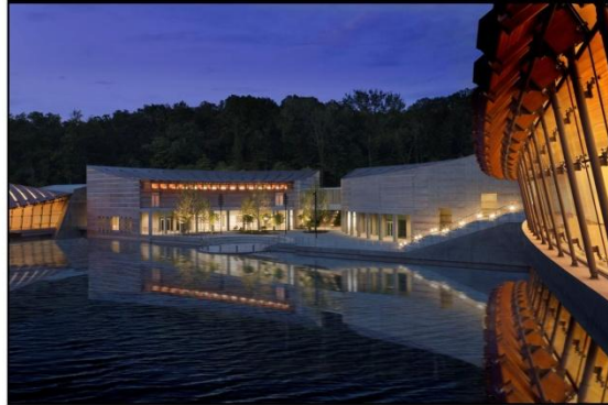
CRYSTAL BRIDGES MUSEUM OF AMERICAN ART BENTONVILLE, AR

Summary Completed in 2011, Crystal Bridges Museum of American Art showcases a permanent collection spanning five centuries of American masterworks from the Colonial era to the current day. In addition to the galleries, the Museum complex encompasses a library, a hands-on experience studio and drop-in studio, a glass enclosed gathering hall for lectures, films and other events, a museum store, restaurant and outdoor concert and event space. In addition, more than three miles of walking and biking trails wind through the Museum's 120 acre grounds. As development manager for the project, Hines provided innovative solutions for a number challenges related to the unique design and location.